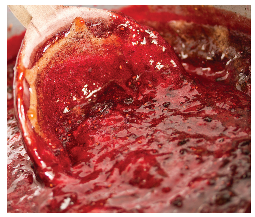
Depending on your needs, from liquid to solid, from cold to hot, we have the right products