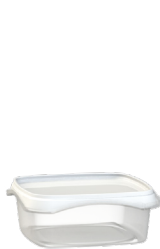
Mod.: 22531 8 oz. - (250 ml) 4.16" (W) X 1.57" (H)