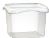
Mod.: 25031 16 oz. - (500 ml) 4.14" (W) X 2.93" (H)