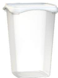
Mod.: 28231 28 oz. - (750 ml) 4.16" (W) X 5.77" (H)