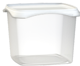
Mod.: 21551 48 oz. - (1.5 L) 5.60" (W) X 4.40" (H)