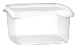
Mod.: 21151 32 oz. - (1 L) 5.60" (W) X 2.89" (H)