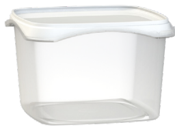
Mod.: 21351 40 oz. - (1.25 L) 5.60" (W) X 3.65" (H)