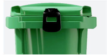
Optional Mantisway lock