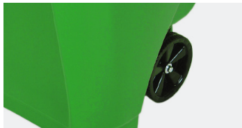
Optional 12.7 cm (5 in.) IPL plastic wheels