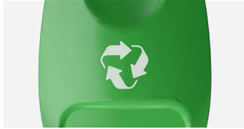
Multicolor hot stamping