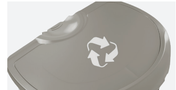
Hot-stamping on lid and container