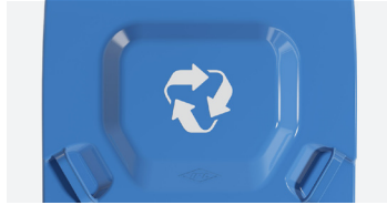
Multicolor hot stamping with company logo