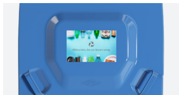
Injection molding labeling on lid (IML)