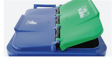
Split option for 64 US Gal / 240L & 95 US Gal / 360L option