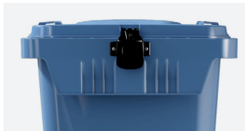
MantisWay latch option for 32 US Gal / 120L