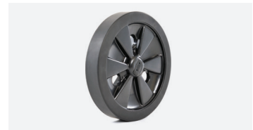
Silent Dual TPE-rubber and plastic wheels offered in 10" & 12"