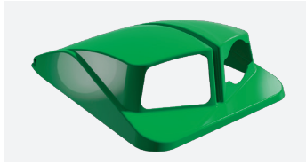
Urban Lid for 95 US Gal / 360L option