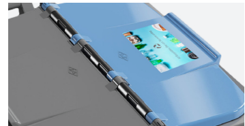
In mold labeling - IML (LID)