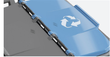
Multicolor hot stamping