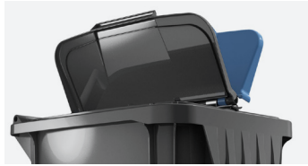
Waste and recycling