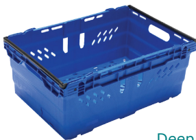
Deep Tray Deep tray for larger loads