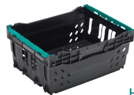
Half Tray Two stack side-by-side on 600 x 400mm trays