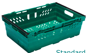
Standard Tray The industry standard produce tray