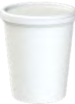
Mod.: 27523 28 oz. - (840 ml) 4.56" (W) X 5.17" (H)