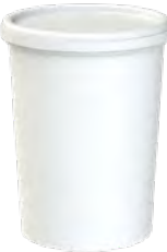
Mod.: 21123 34 oz. - (1 L) 4.56" (W) X 5.83" (H)