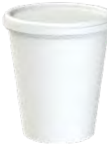
Mod.: 26523 26 oz. - (780 ml) 4.56" (W) X 5.05" (H)