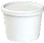
Mod.: 25023 18 oz. - (540 ml) 4.56" (W) X 3.23" (H)