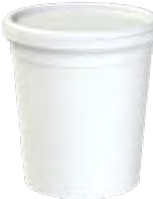
Mod.: 27423 27 oz. - (800 ml) 4.56" (W) X 4.82" (H)