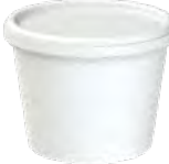
Mod.: 25123 18 oz. - (540 ml) 4.56" (W) X 3.36" (H)