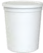
Mod.: 21120 32 oz. - (1 L) 4.59" (W) X 5.28" (H)