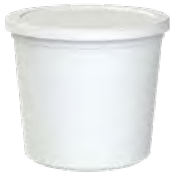
Mod.: 27520 24 oz. - (750 ml) 4.59" (W) X 4.02" (H)