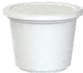
Mod.: 25020 16 oz. - (500 ml) 4.59" (W) X 3.49" (H)