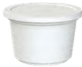
Mod.: 24020 14 oz. - (425 ml) 4.59" (W) X 2.92" (H)