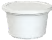
Mod.: 23520 12 oz. - (350 ml) 4.59" (W) X 2.72" (H)