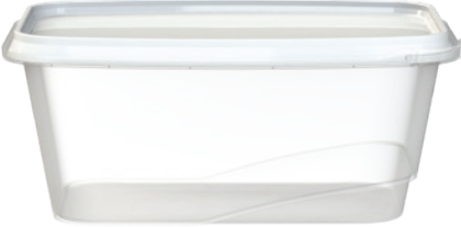
Mod.: 25086 16 oz. - (500 ml) 5.80" (L) x 4.15" (W) x 2.45" (H)