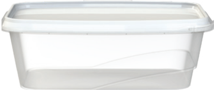
Mod.: 23586 12 oz. - (350 ml) 5.80" (L) x 4.15" (W) x 1.97" (H)