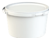
Mod.: 21560 48 oz. - (1.5 L) 6.78" (W) X 3.89" (H)