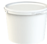
Mod.: 22060 64 oz. - (2 L) 6.69" (W) X 4.87" (H)