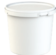
Mod.: 22570 84 oz. - (2.5 L) 6.83" (W) X 6.16" (H)