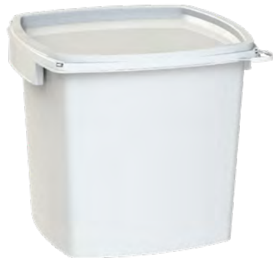
Mod.: 22564 84 oz. - (2.5 L) 6.57" (W) X 5.90" (H)