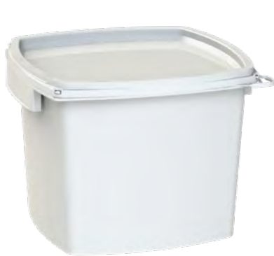
Mod.: 22064 64 oz. - (2 L) 6.68" (W) X 4.95" (H)