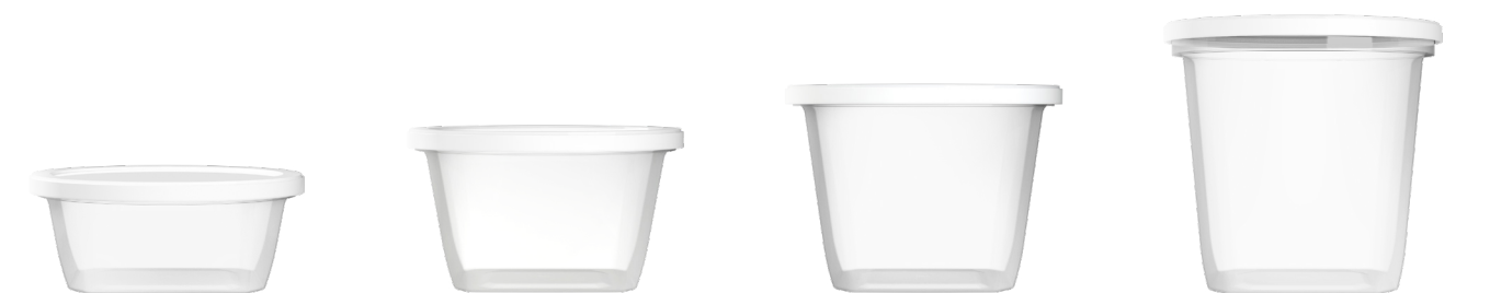
8 oz. - 250 ml 4,600" (D) X 1,743" (H)